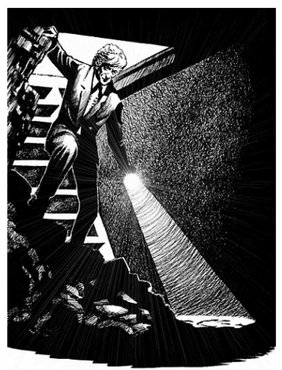
Whatever had been in the house had clearly used this route. His suspicions were soon confirmed when he found two distinctive three-clawed footprints in the increasingly damp sand.

He was dealing with another colony of Silurians. Would they be hostile or relaxed? Would they allow him to mediate with the humans, as he'd tried to once before?